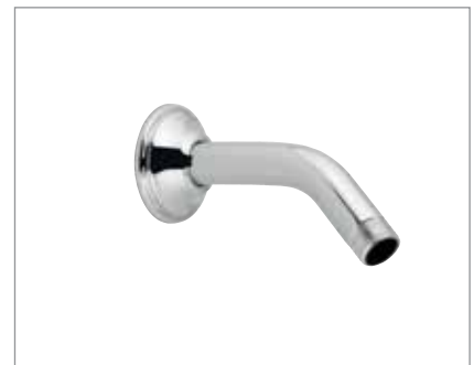
TS200N6: Shower Arm 6"

Please note the following components are sold separately