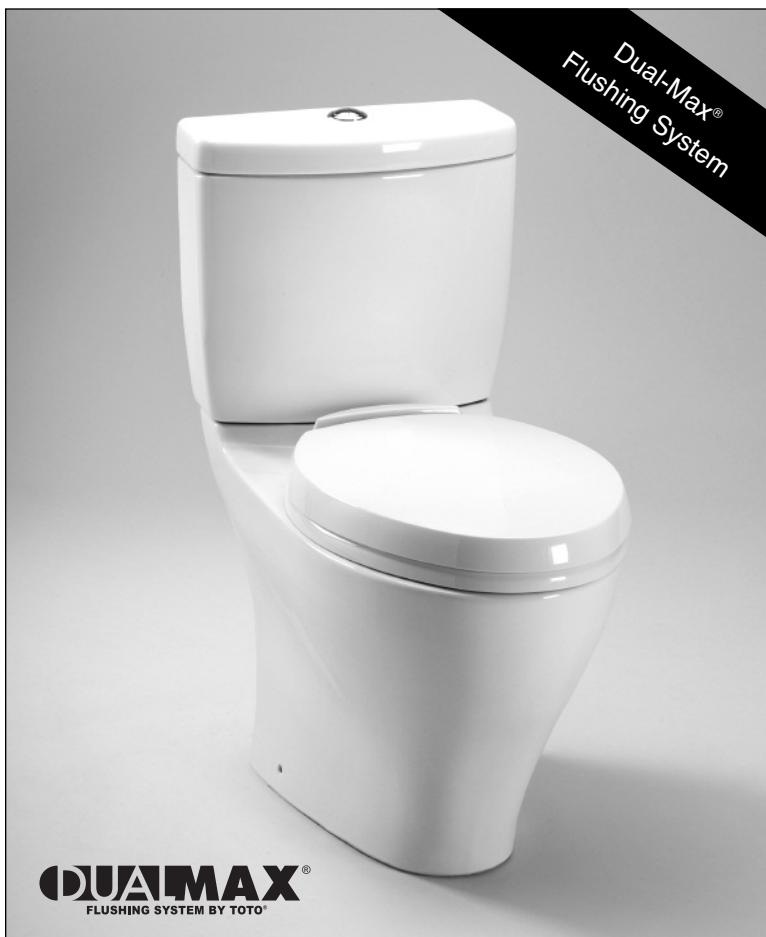
CST414M - Aquia® Close Coupled Toilet with SS204 - SoftClose® Oval Seat