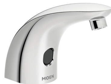
M•Power™ Transitional Style Electronic Soap Dispenser