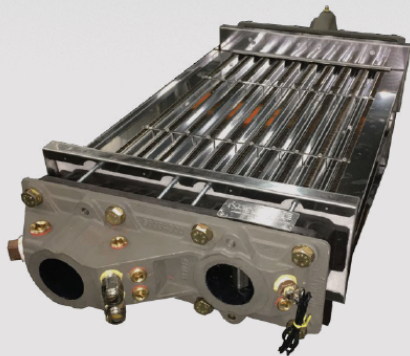
Field proven ASME heat exchanger with copper or cupronickel finned tubes and glass lined cast iron headers.