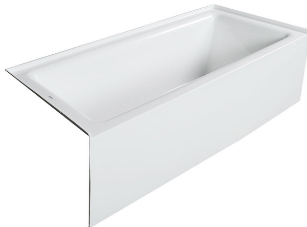
Model Shown with Skirt & Tile Flange